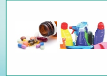
Medicines & Chemicals