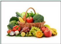
Fruits & Vegetables