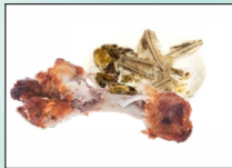
Poultry & Fish