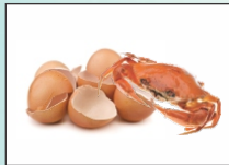
Egg & Crab Shells