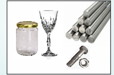
Glass / Metal